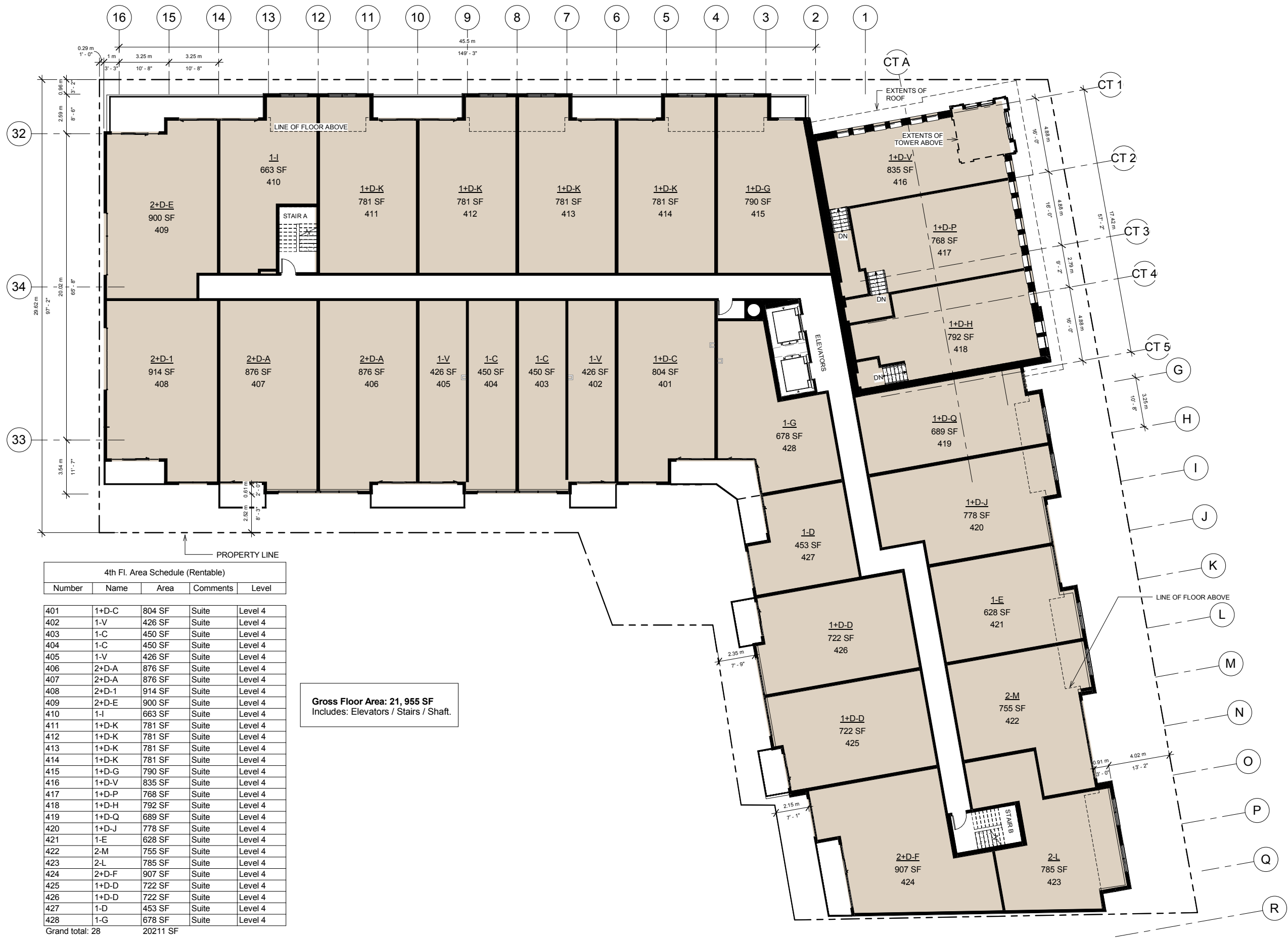
4th Fl. Area Schedule (Rentable)