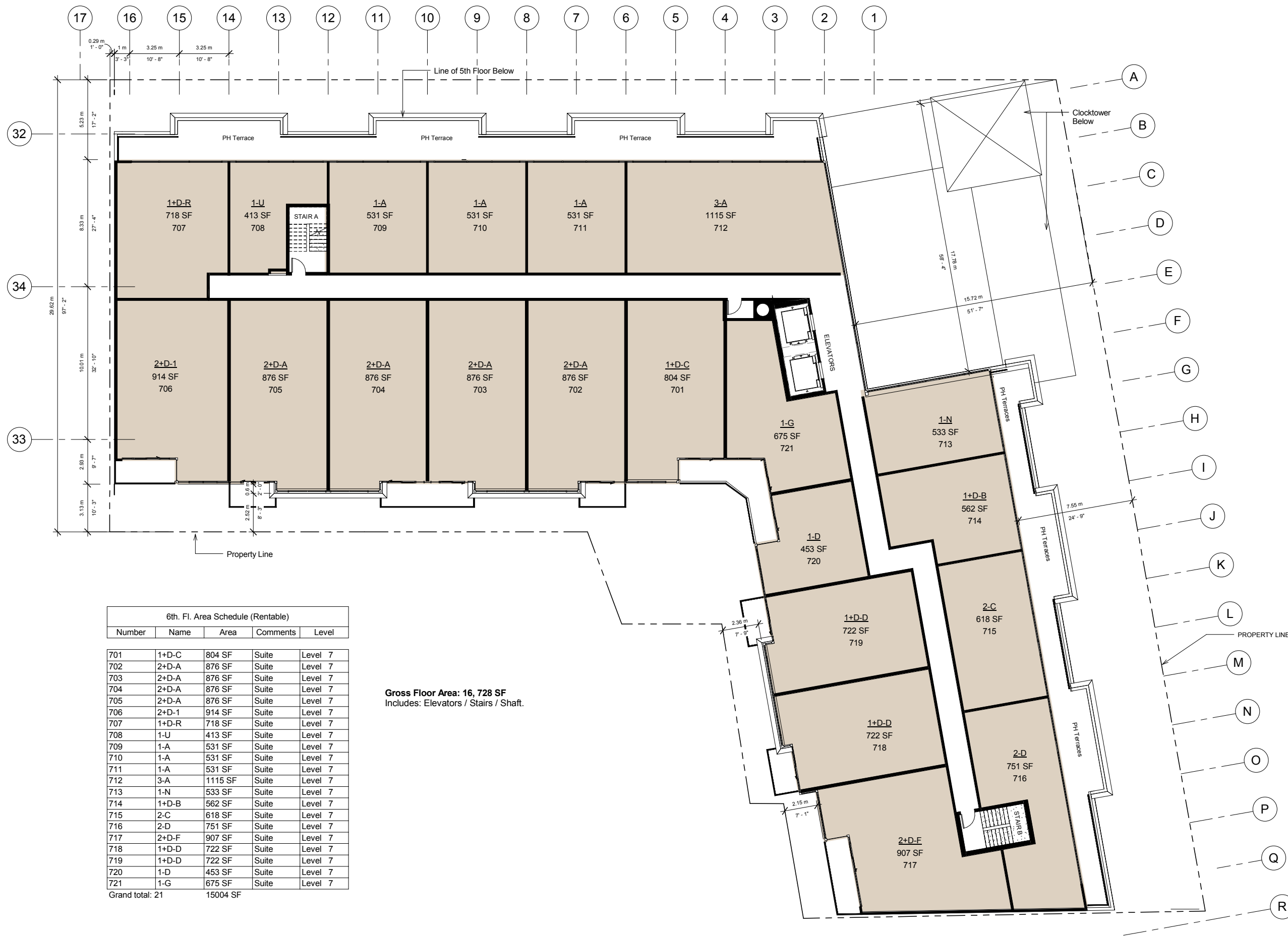
6th. Fl. Area Schedule (Rentable)